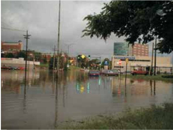
Flooding along Saddle Creek Road.