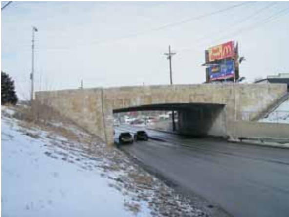
Historic bridge and limited pedestrian access.

Funding has only been obtained for the Feasibility and Environmental Studies. If the project is feasible, additional funding is needed for design, right-of-way acquisition, and construction.